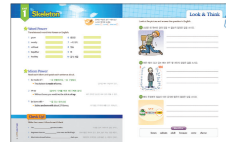
▶ Reading & Writing Section