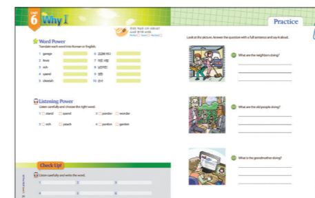
▶ Listening & Speaking Section